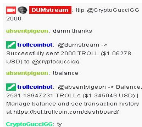
Figure 1. Tipping and Balance Functions

Trollcoin is the ultimate donation medium on Twitch with its colourful communities entrenched in $Troll culture. Twitch was the inspiration and remains a driving force of Trollcoin's continued development. Functions of the Twitch Trollcoinbot include: a !tip function: that allows a user to send Trollcoin to any Twitch user and the !balance function which displays a user's Trollcoin balance. Both functions display the corresponding USD value as shown in figure 1.